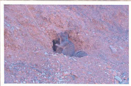
Holes, cliff hazards